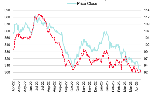
Siam Cement (SCC TB)